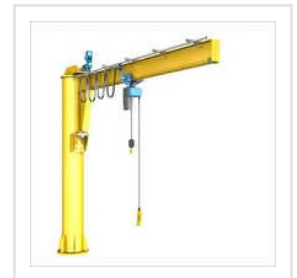
Industrial JIB Crane