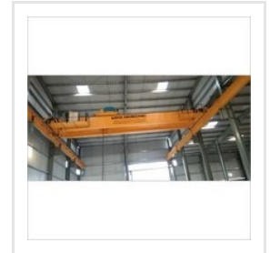
Double Girder EOT Crane