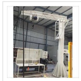
Pillar Mounted JIB Crane