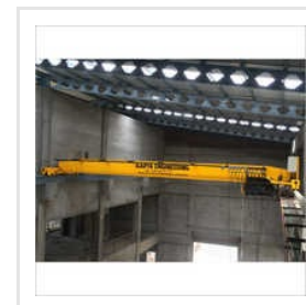
Single Girder EOT Crane