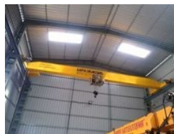
INDUSTRIAL SINGLE GIRDER EOT CRANE