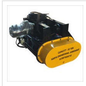
Electric Wire Rope Hoist