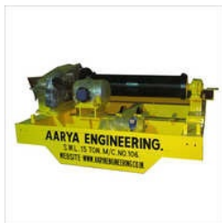
EOT CRAB ASSEMBLY

Double Girder EOT Crane, EOT Crab Assembly, EOT Wire Rope Hoist, Electric Wire Rope Hoist, Flame Proof Electric Wire Rope Hoist, Flexible Electric Wire Rope Hoist, Industrial EOT Crane, Industrial Girder EOT Crane, Industrial Goliath Crane, Industrial JIB Crane, Industrial Single Girder EOT Crane, Industrial Under Slung Crane, Pillar Mounted JIB Crane, Single Girder EOT Crane, etc.