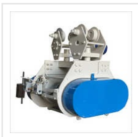
Flexible Electric Wire Rope Hoist