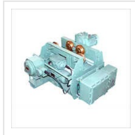
Flame Proof Electric Wire Rope Hoist