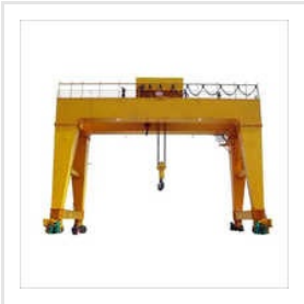
Industrial Goliath Crane