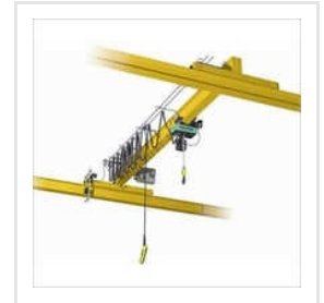
Industrial Under Slung Crane