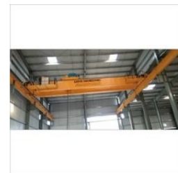
DOUBLE GIRDER EOT CRANE