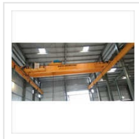
Industrial Girder EOT Crane