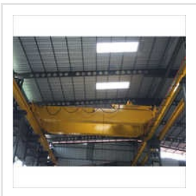
Industrial EOT Crane