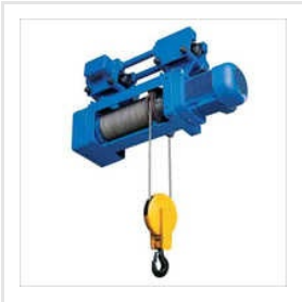
EOT Wire Rope Hoist