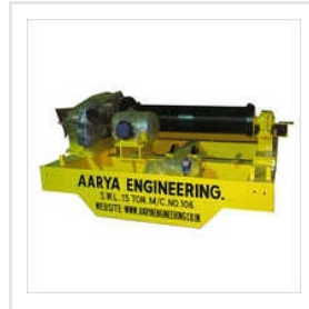
EOT Crab Assembly